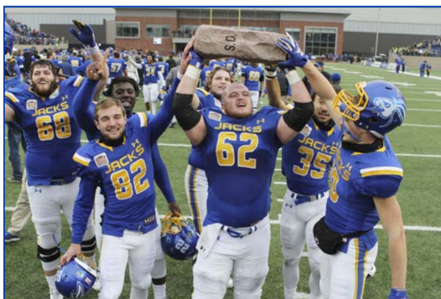
South Dakota State retained the Dakota Marker with a 33-21 home victory over second-ranked North Dakota State.