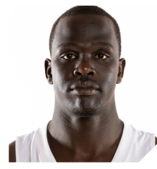
3 MAWOT MAG Sr. • 6-7 • 216 • F Melbourne, Australia