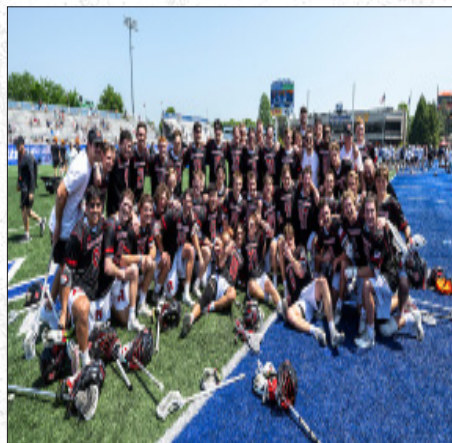
The 2022 squad celebrates a victory that sent the team to the Final Four for the first time in program history.

In 2015, Rutgers lacrosse embarked on a new journey. The Scarlet Knights were part of the inaugural season of Big Ten Conference Lacrosse. Rutgers joined Maryland, Michigan, Penn State, Ohio State, and affiliate member Johns Hopkins as the Big Ten sponsored men's lacrosse for the first time. RU earned its first Big Ten win with a 17-10