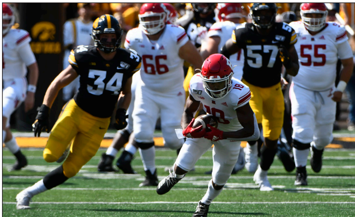
Football Drops Big Ten Opener at No. 20 Iowa

No. 20 Iowa 30, Rutgers 0 Sept. 7, 2019 • Iowa City, Iowa Kinnick Stadium • 61,808