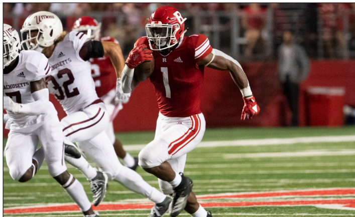
Football Kicks Off 150th Season with 48-21 Victory over UMass

Rutgers 48, Massachusetts 21 Aug. 30, 2019 • Piscataway, N.J. SHI Stadium • 40,515