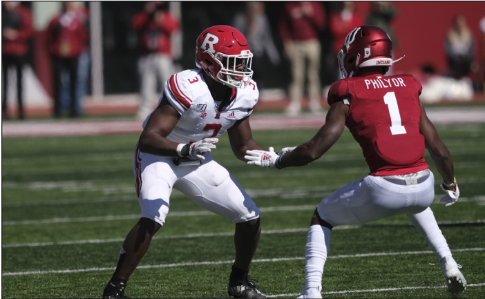
Football Loses at Indiana

Indiana 35, Rutgers 0 Oct. 12, 2019 • Bloomington, Ind. Memorial Stadium • 37,055