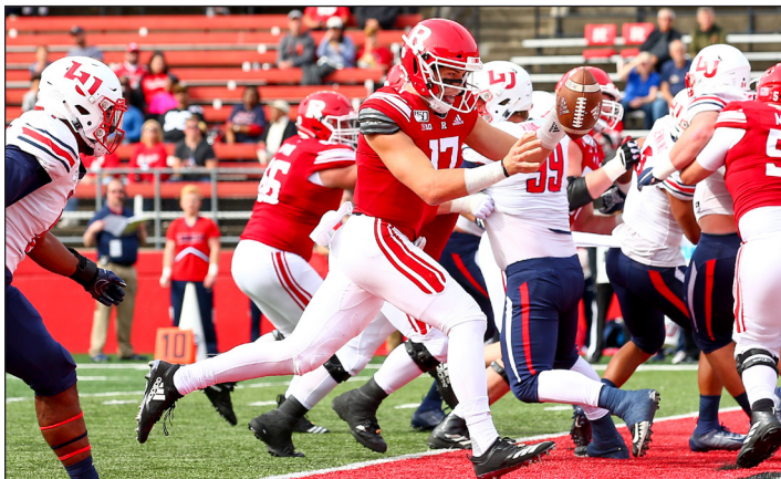
Football Claims Victory over Liberty, 44-34

Rutgers 44, Liberty 34 Oct. 26, 2019 • Piscataway, N.J. SHI Stadium • 23,058