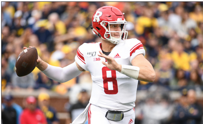
Football Falls at No. 20 Michigan

No. 20 Michigan 52, Rutgers 0 Sept. 28, 2019 • Ann Arbor, Mich. Michigan Stadium • 110,662