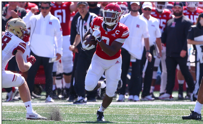
Football Falls to Boston College

Boston College 30, Rutgers 16 Sept. 21, 2019 • Piscataway, N.J. SHI Stadium • 32,217