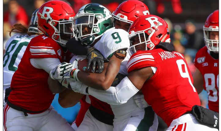
Football Drops Home Finale to Michigan State

Michigan State 27, Rutgers 0 Nov. 23, 2019 • Piscataway, N.J. SHI Stadium • 24,641