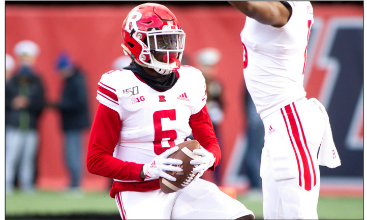
Football Stopped in Second Half at Illinois

Illinois 38 , Rutgers 10 Nov. 2, 2019 • Champaign, Ill. Memorial Stadium • 35,652