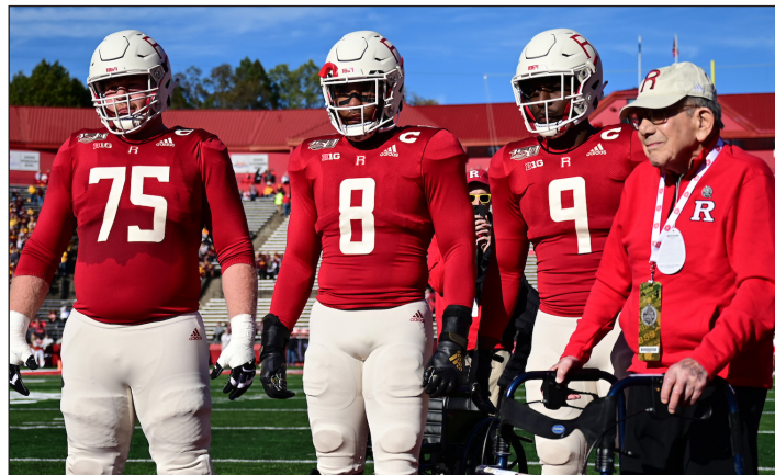
Football Downed by Minnesota on Homecoming

No. 20 Minnesota 42, Rutgers 7 Oct. 19, 2019 • Piscataway, N.J. SHI Stadium • 26,429