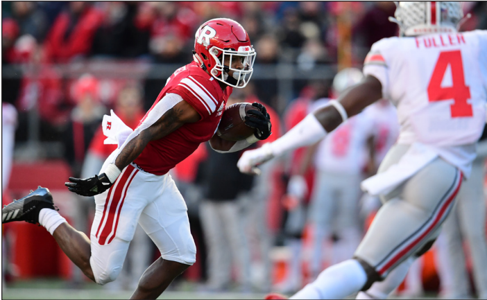
Football Stumped by No. 2 Ohio State

No. 2 Ohio State 56, Rutgers 21 Nov. 16, 2019 • Piscataway, N.J. SHI Stadium • 33,528