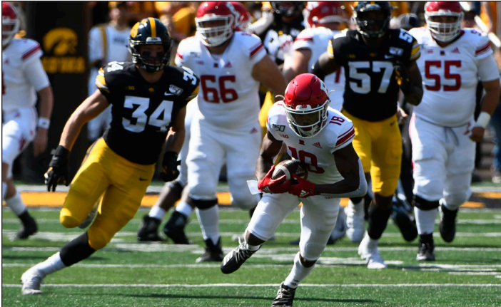
Football Drops Big Ten Opener at No. 20 Iowa

No. 20 Iowa 30, Rutgers 0 Sept. 7, 2019 • Iowa City, Iowa Kinnick Stadium • 61,808