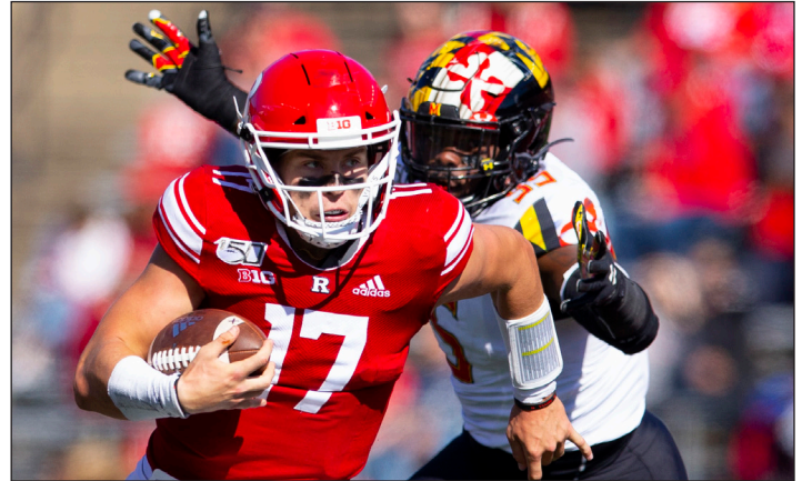
Football Topped by Maryland

Maryland 48, Rutgers 7 Oct. 5, 2019 • Piscataway, N.J. SHI Stadium • 30,185