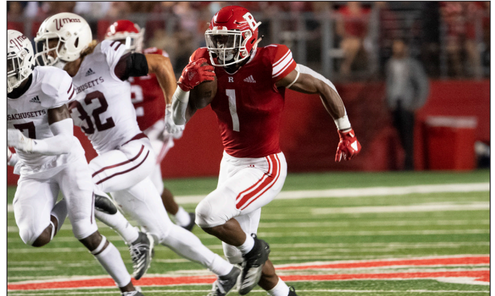
Football Kicks Off 150th Season with 48-21 Victory over UMass

Rutgers 48, Massachusetts 21 Aug. 30, 2019 • Piscataway, N.J. SHI Stadium • 40,515