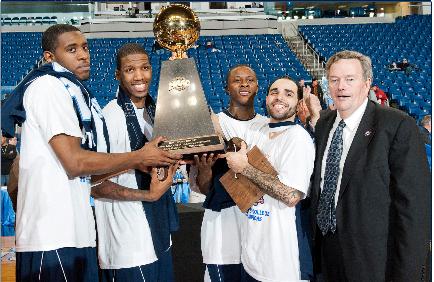
*Saint Peter's last won a MAAC Men's Basketball Championship in 2011