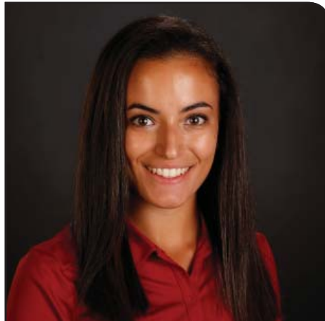
5-6 • Junior

Low 54 vs. Par: +4- 2017 SEC Championship