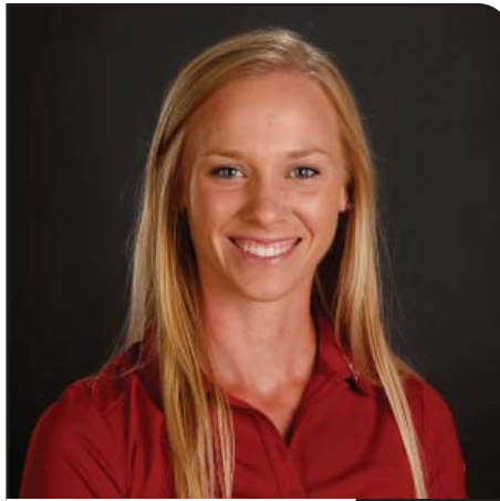
5-7 • Senior

Tournaments Under Par: 4, last 2017 SEC Championship