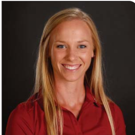
5-7 • Senior

Tournaments Under Par: 3, last 2017 2017 Bryan National Collegiate