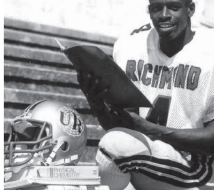
Leland Melvin, now a NASA astronaut, caught 10 passes for 132 yards and scored one TD as Richmond fell to Rhode Island, 23-17, in its first-ever NCAA Quarterfinal game.