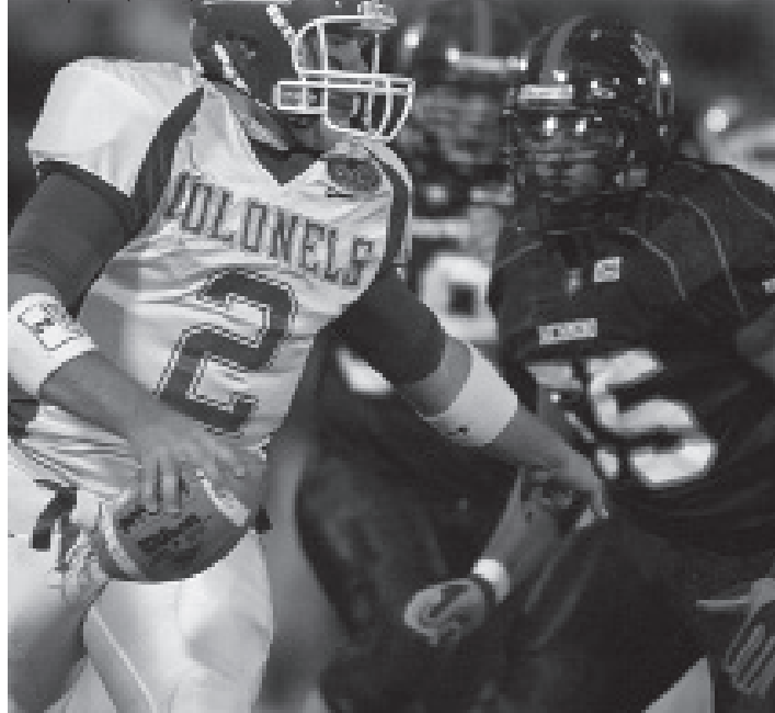
The Richmond defense gave EKU no where to run and no where to hide, forcing four turnovers and holding the Colonels to just 54 rushing yards in the NCAA first-round win.