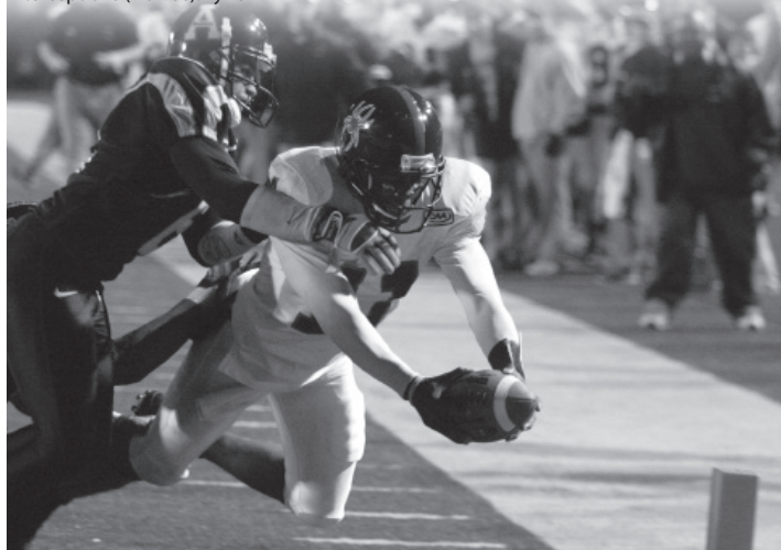
Richmond stunned the Appalachian State sell-out crowd of 24,140 with three straight TDs to tie the game at 35-35, before the eventual National Champs pulled away late.