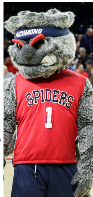
Richmond mascot WebstUR