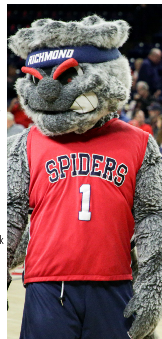
Richmond mascot WebstUR