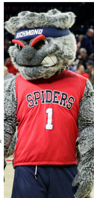
Richmond mascot WebstUR