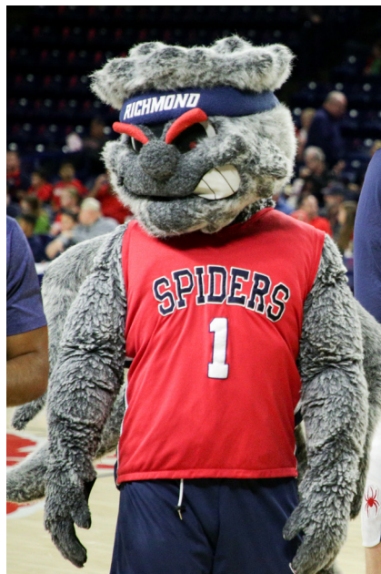
Richmond mascot WebstUR