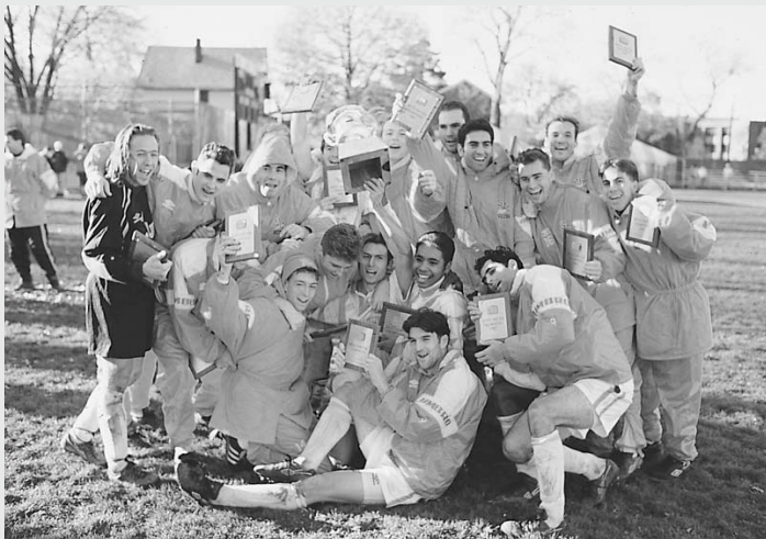
1993 BIG EAST TOURNAMENT Finals - St. John's 2, Boston College 0 (OT) Semifinals - St. John's 6, Villanova 4 (OT)

In a rematch of the 1991 BIG EAST Tournament championship, St. John's exacted revenge on Seton Hall and defeated the Pirates, 2-1, in the 1992 final. The Red Storm handed Georgetown a 2-1 loss in the semifinals in what was the program's second-straight BIG EAST Tournament appearance – the first two in school history.