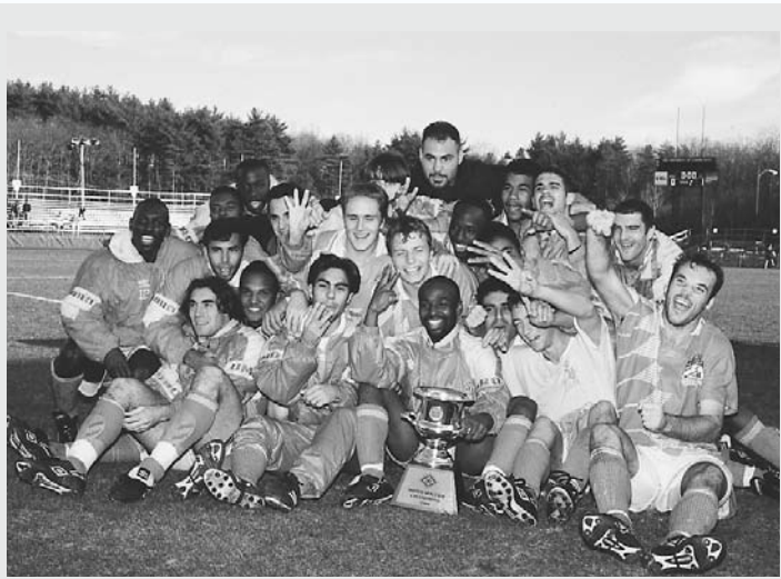
1994 BIG EAST TOURNAMENT Finals - St. John's 1, Georgetown 0 Semifinals - St. John's 4, Boston College 0