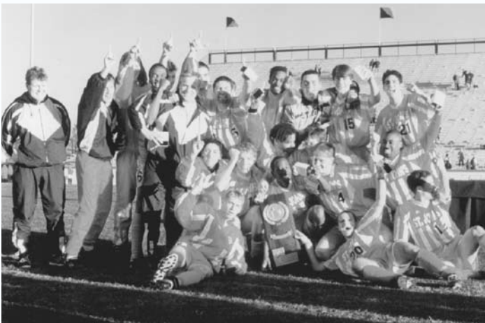
Searching for the first NCAA Tournament win in program history, the Red Storm won five straight contests by a combined 15-5 margin to capture the 1996 NCAA Championship.

Finals at Richmond, Va. St. John's 4, Florida International 1