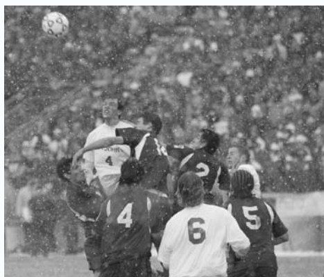
In 2003, the Red Storm advanced to the NCAA College Cup for the third time in eight seasons and played Indiana in the national championship game.