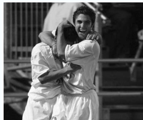
St. John's became the nation's only program to advance to 10 consecutive NCAA Rounds of 16 by defeating Marist, 3-1, and No. 16 seed Dartmouth, 1-0 during the 2005 season.