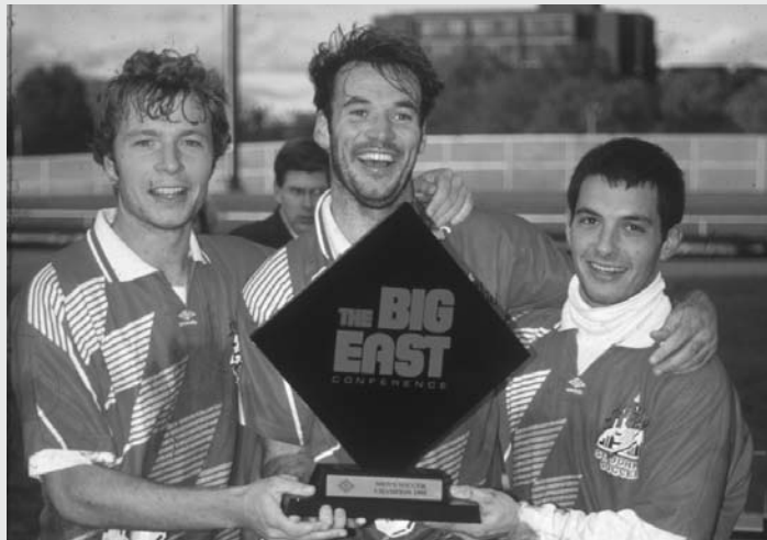
1995 BIG EAST TOURNAMENT Finals - St. John's 2, Pittsburgh 0 Semifinals - St. John's 2, Boston College 1 Quarterfinals - St. John's 2, Syracuse 1

St. John's held two opponents scoreless and defeated top-seeded Georgetown in the championship game, as the Red Storm won its third-consecutive BIG EAST Tournament title. St. John's finished the regular season with a 6-1-1 mark in the conference and entered tournament action as the No. 2 seed.