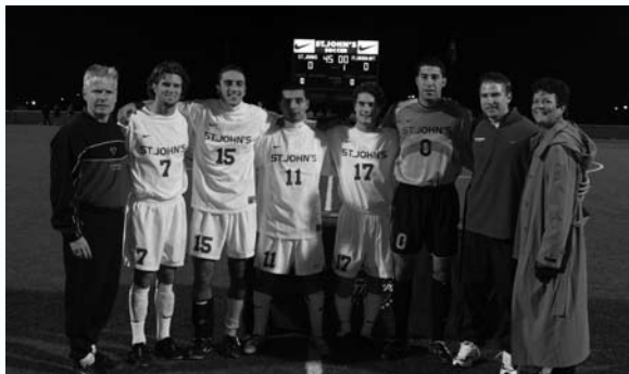
The 2003 senior class appeared in two NCAA College Cups and one national championship game and posted a 61-17-3 overall record in four seasons.

In many ways, it will go down as one of the most memorable St. John's men's soccer seasons in program history.