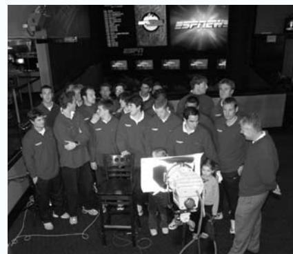
By advancing to the NCAA College Cup for the second time in three seasons, the 2003 team began a current, eight-game home unbeaten streak in the NCAA Tournament.