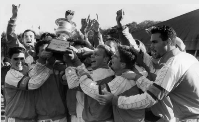
1992 BIG EAST TOURNAMENT Finals - St. John's 2, Seton Hall 1 Semifinals - St. John's 2, Georgetown 1