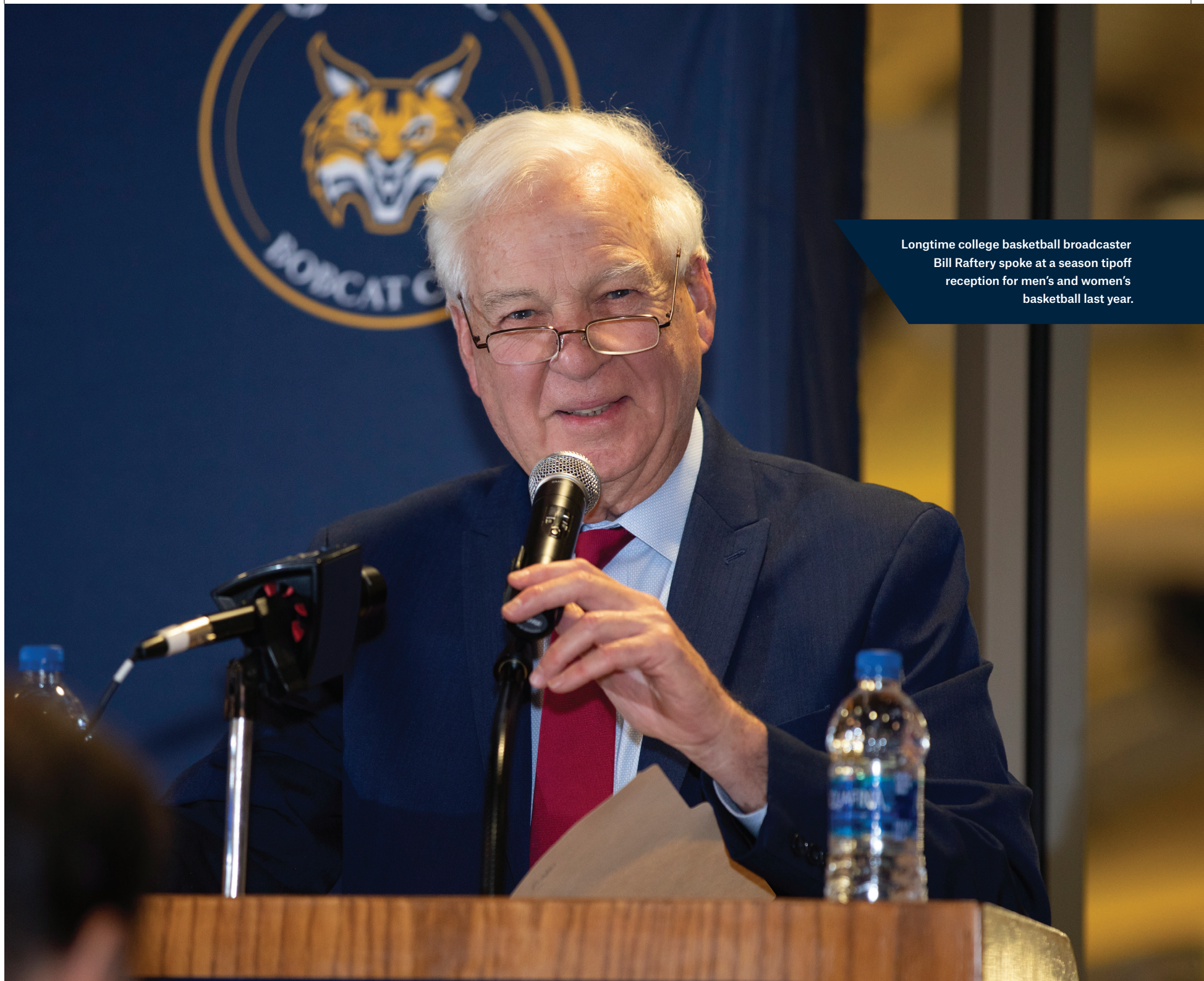
Longtime college basketball broadcaster Bill Raftery spoke at a season tipoff reception for men's and women's basketball last year.