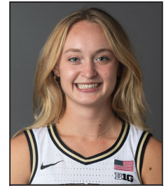
14 AVA LEARN