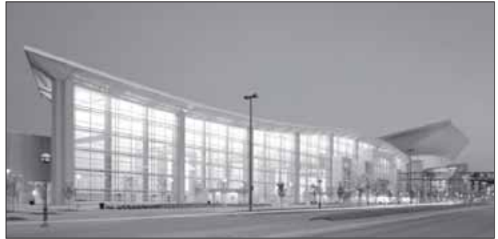
The Qwest Center in Omaha, Neb., will play host to the 2006 NCAA Volleyball Championships. The event will be hosted by the University of Nebraska on Dec. 14 and 16.

Friday - Sunday, Dec. 14-16 Omaha, Neb. • Qwest Center Omaha