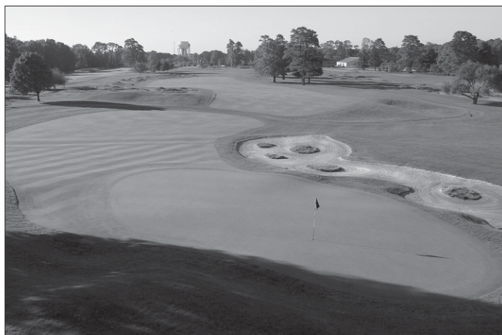
Kampen Course - No. 1