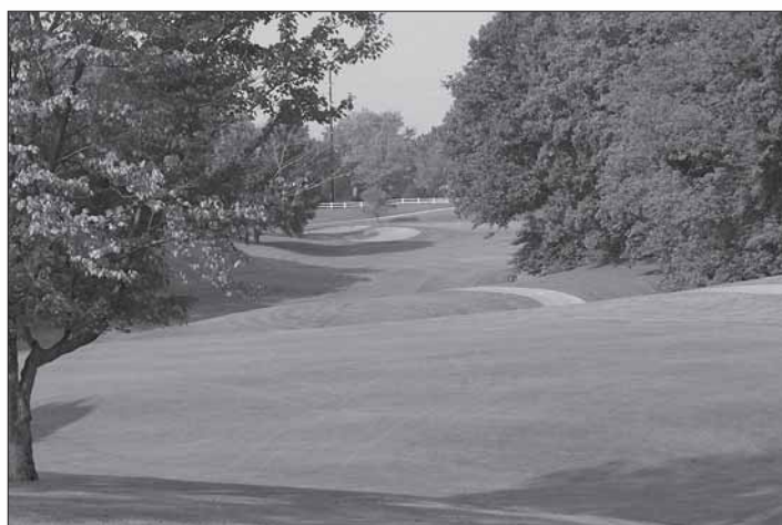
Ackerman Hills - No. 5