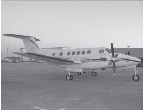
When traveling on Purdue planes, the team departs from the Purdue Airport, located on campus.

When travelling, Purdue goes first class. The Boilermakers periodically fly to tournaments aboard one of the university's planes.