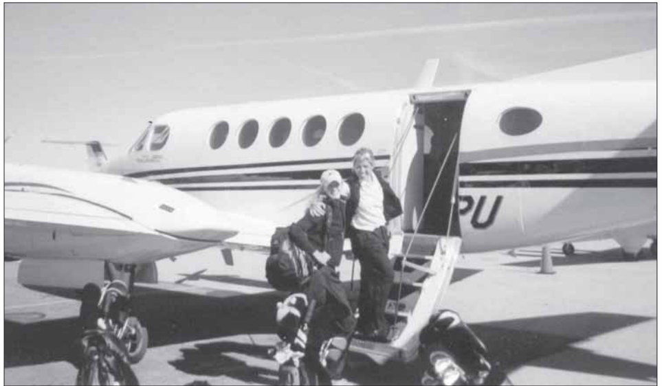
The Boilermakers board the plane at the Purdue airport.