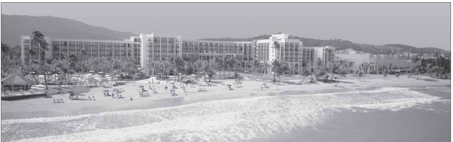
The Westin Rio Mar is where the Boilermakers stay each year for Lady Puerto Rico Classic.