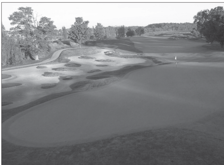
Hole No. 9 is a par four with trouble along the left side of the fairway and right side of the green.