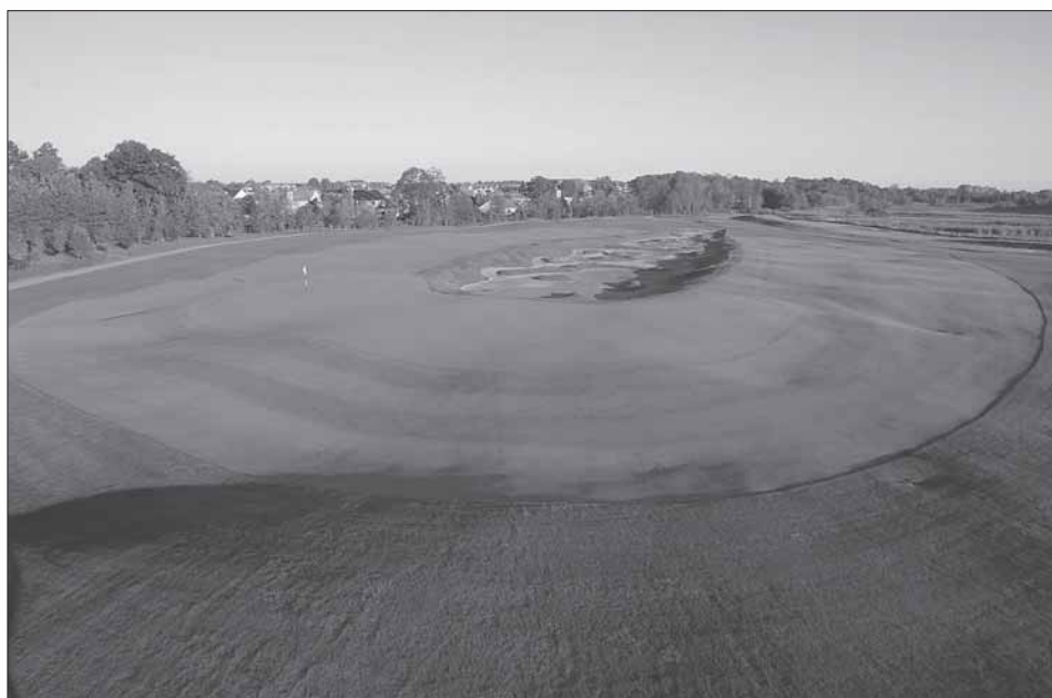
Hole No. 7 has a bunker running down the middle of its fairway.

Both the tee shot and the second shot set up left to right on this long par 5. Stay left throughout this hole. The bog runs along the right side.