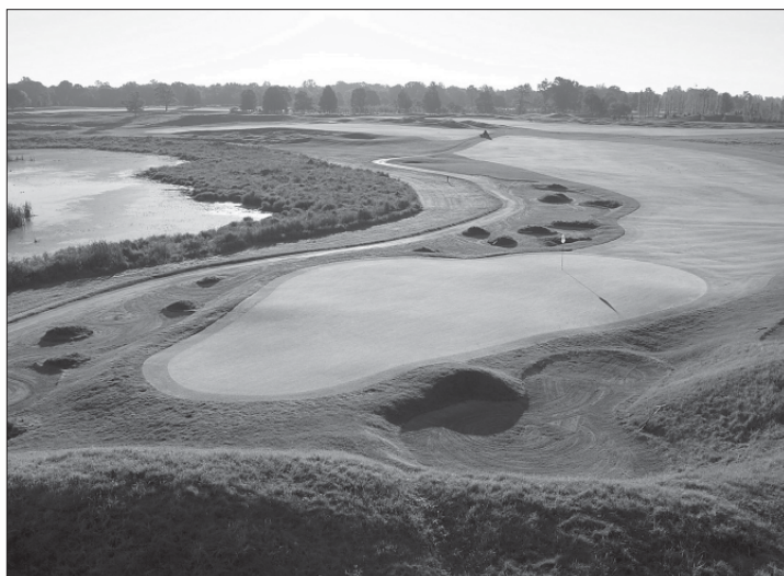
A par five, No. 6 wraps around a celery bog into a heavily guarded green.

The back nine opens unmercifully with a very long par 5. A waste bunker guards the entire right side of the driving area. There is room to the right for your second shot. A bunker and water come into play to the left of the elevated green.