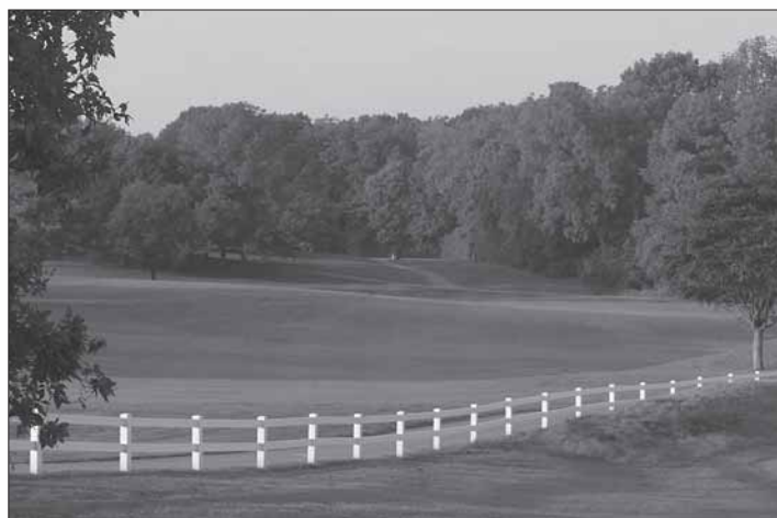
Ackerman Hills - No. 18