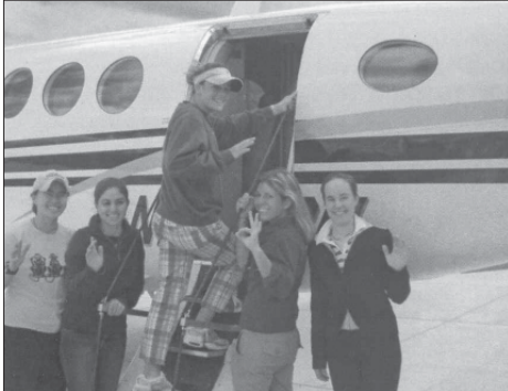
Purdue planes allow the Boilermakers to get back to campus quickly after tournaments.