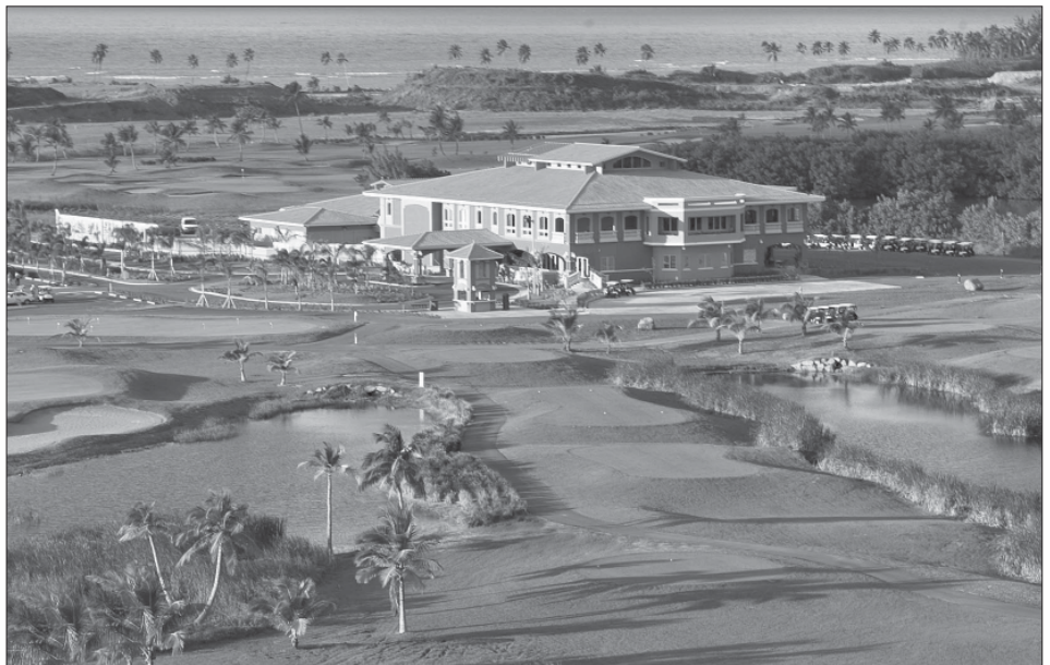
The CoCo Beach Resort is the home of the 2006 Lady Puerto Rico Classic, hosted by Purdue in February.