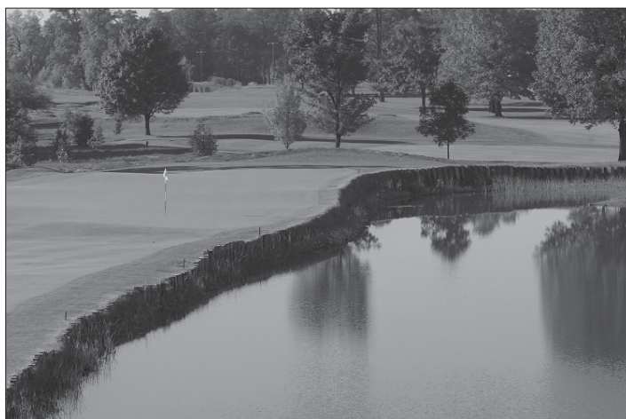
Kampen Course - No. 17