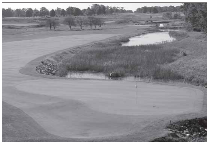
No. 14 is a short par 4 with a bog along the left side of the fairway and green.