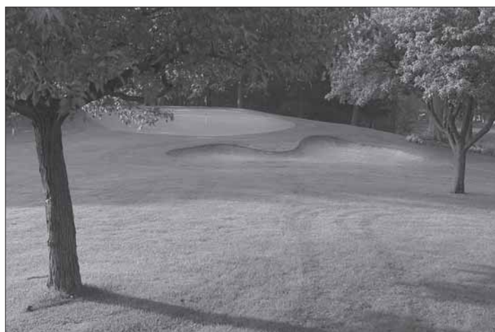
Ackerman Hills - No. 12