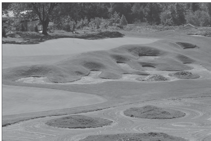
Kampen Course - No. 18