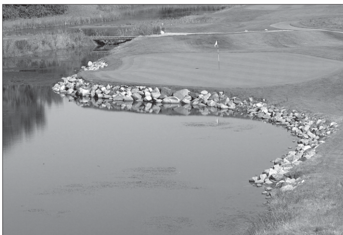
The par-3 13th has water along the entire front and left side of the green.

The final hole on the Kampen Course is also the most difficult. This very long par 4 sets up right to left from the tee. There is a large bunker guarding the left side of the driving area. Hitting the fairway is a must, as the approach shot to this green is by far the most difficult on the course.