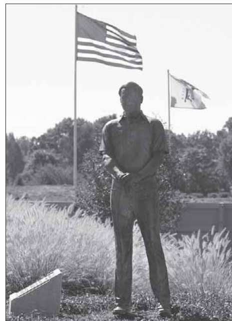
A statue of Emerson Kampen overlooks the tee boxes on hole No. 1.

This extremely long par 5 has a tee shot that sets up right to left and a second shot that sets up left to right. The large green is elevated with a deep bunker guarding the front.