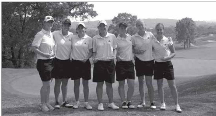
The Boilermakers after their win at the Badger Invitational to begin the season. Purdue won four of five tournaments during the fall season and rose to No. 3 in the rankings.

Purdue concluded the fall season with a win at the Hooters Match Play Championships in Florida. The Boilermakers defeated Oklahoma State, Stanford, Texas A&M and Arizona State to claim top honors.