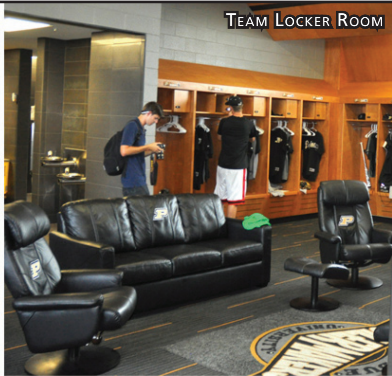
TEAM LOCKER ROOM