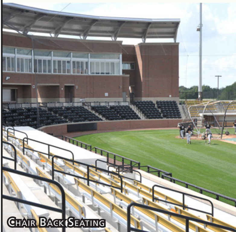
CHAIR BACK SEATING