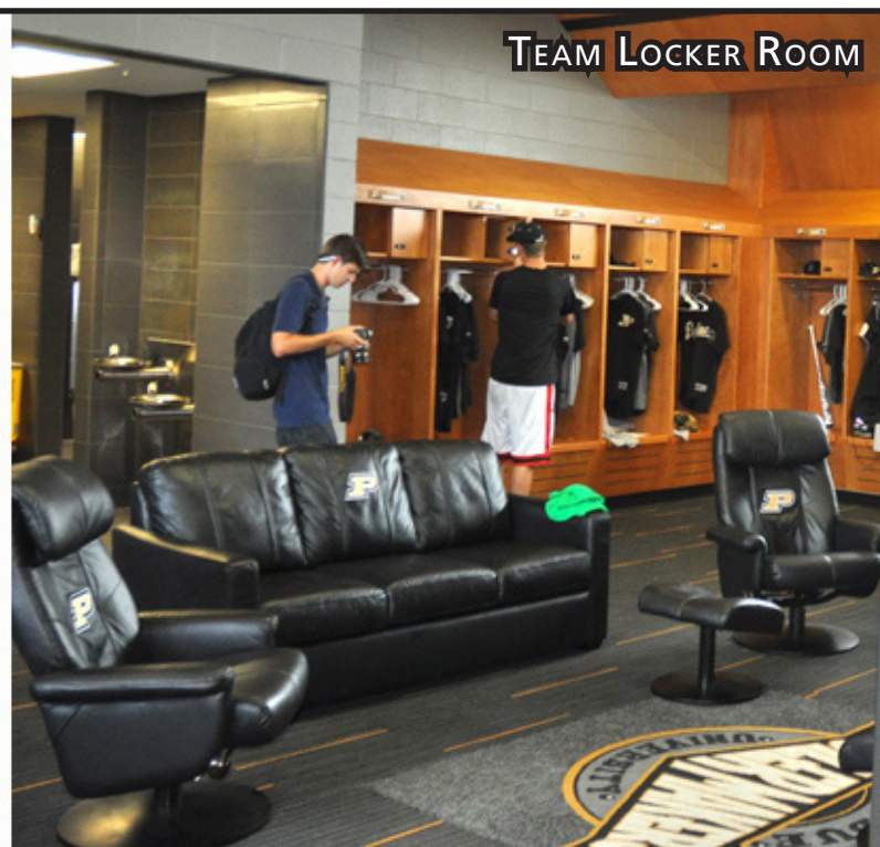
TEAM LOCKER ROOM