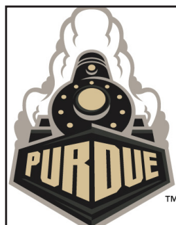
GAME 3 STARTER TBA