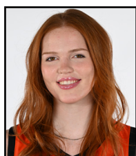
#22 Parker Hill