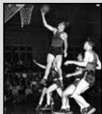
Princeton basketball once played at Hobey Baker Rink.

Hobey Baker Rink was used as a hotel during WWII for servicemen.