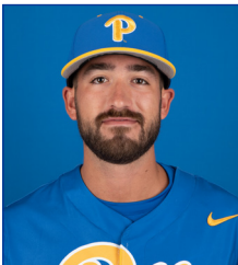
AC Sky DUFF