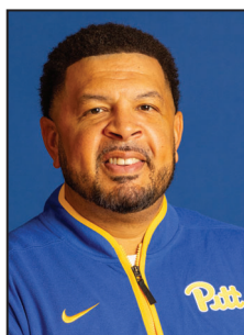
Jeff Capel Head Coach