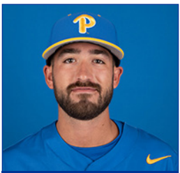
3 Sky DUFF