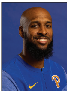
Gilbert Brown Director of Player & Alumni Development