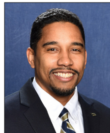
Archie Collins Secondary