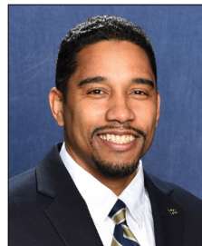
Archie Collins Secondary