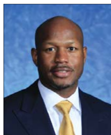
Renaldo Hill Secondary