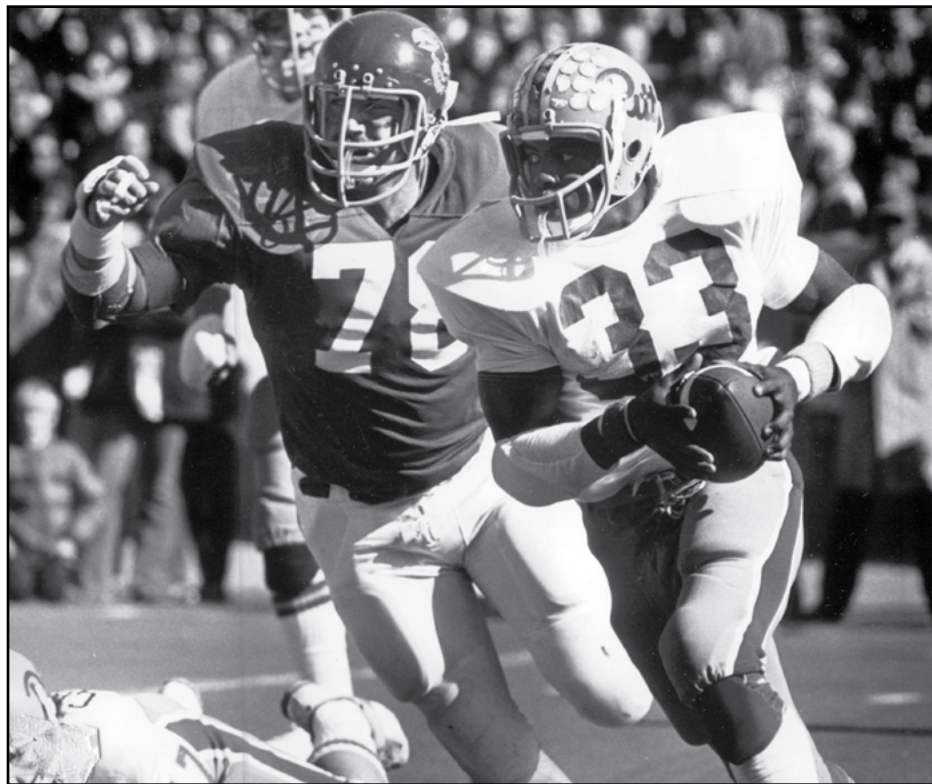
Tony Dorsett rushed for two second-quarter touchdowns and totaled 142 yards on the ground in Pitt's 33-19 win over Kansas in the 1975 Sun Bowl. Dorsett was one of three 100-yard rushers for the Panthers in that victory.