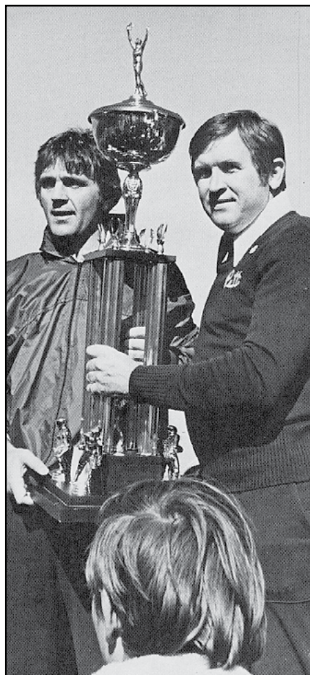
Head coach John Majors and assistant Jackie Sherrill celebrate Pitt's 33-19 defeat of Kansas in the 1975 Sun Bowl.