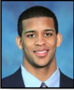
15 Devin Street WR • 6-4 • 190 • SO* Bethlehem, Pa.

2011: Starter in all 12 games...has 48 catches for 692 yards (14.4 avg.) and two TDs...had back-to-back 100-yard receiving games against Cincinnati and Louisville...had 118 yards on a career-high eight catches (14.8 avg.) against Cincinnati...followed that up with a six-catch, 101-yard effort (16.8 avg.) at Louisville...had a career-high 138 yards on seven catches (19.7 avg.) and a 66-yard TD at Iowa.