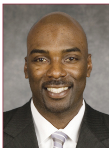
Aaron McKie Assistant Coach Second Season