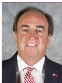
Fran Dunphy Head Coach 10th Season