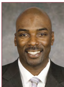
Aaron McKie Assistant Coach Second Season