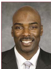
Aaron McKie Assistant Coach Second Season