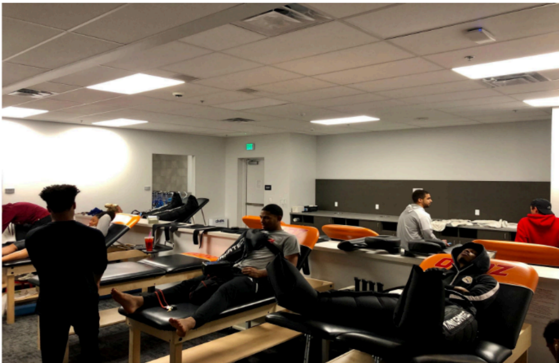
Athletic Trainers Room