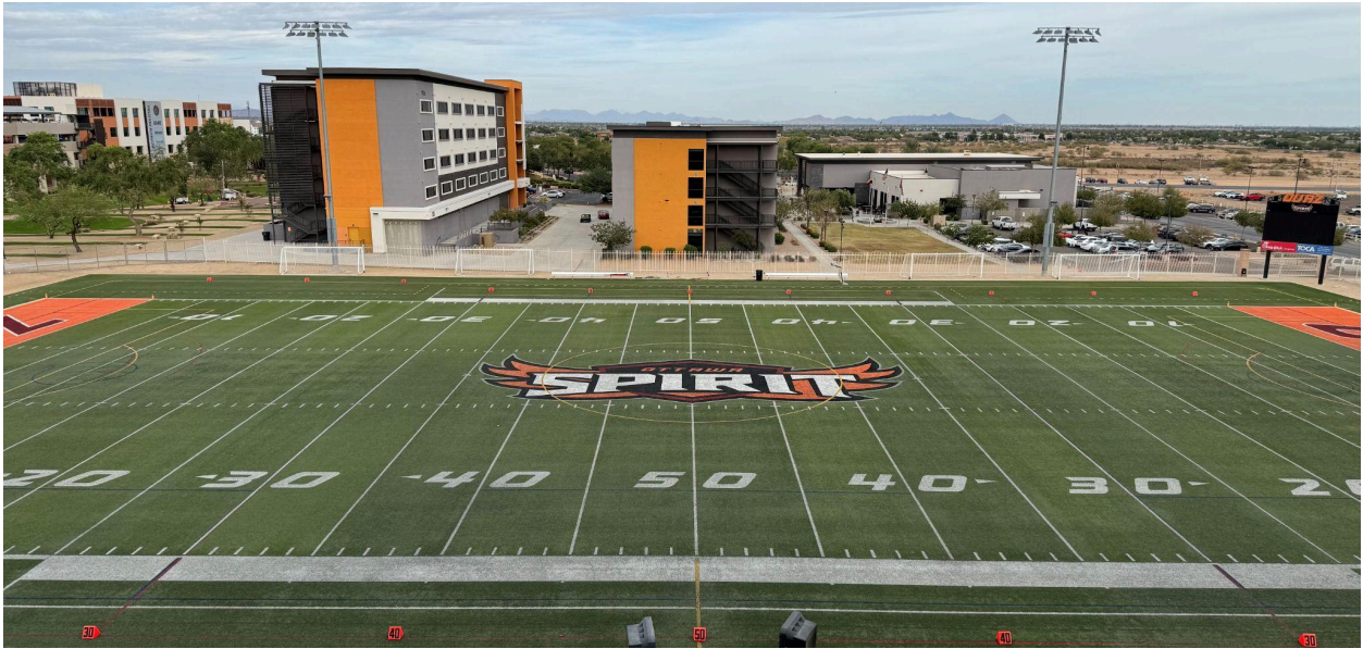
Spirit Field w/ Founder's and Veritas Hall