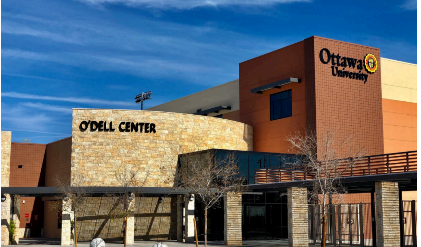
The O'Dell Center