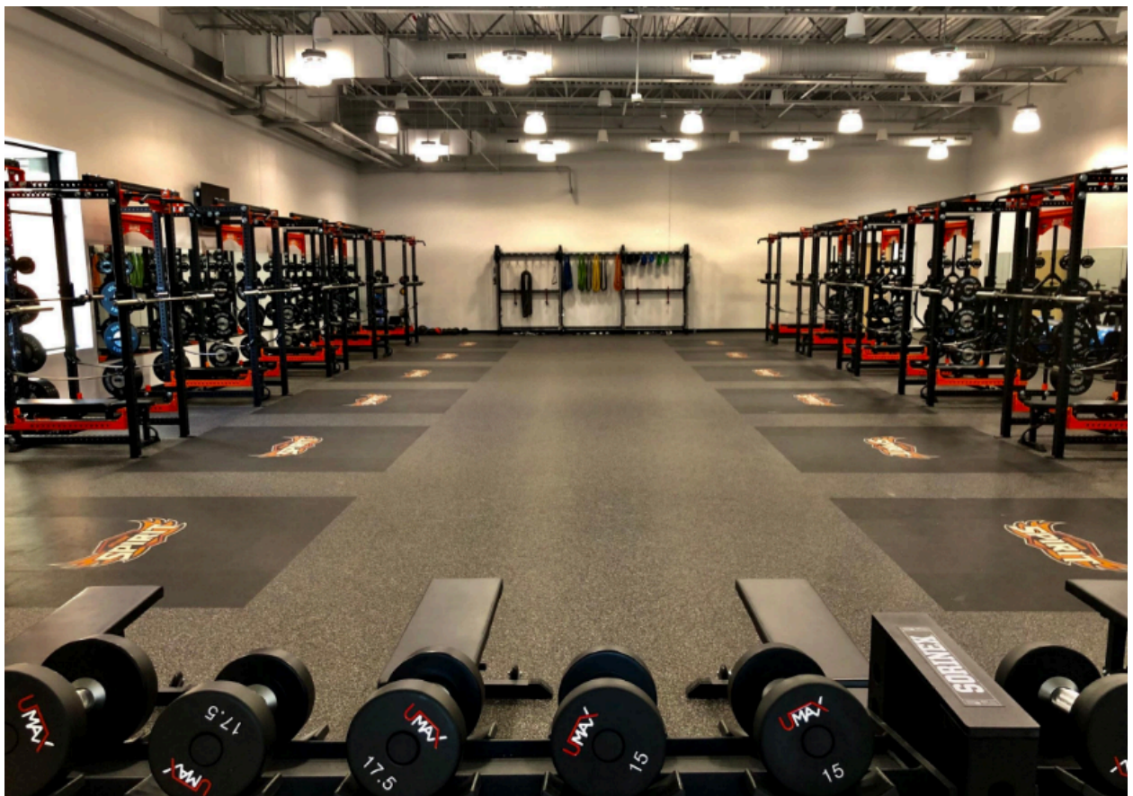
Weight Training Room