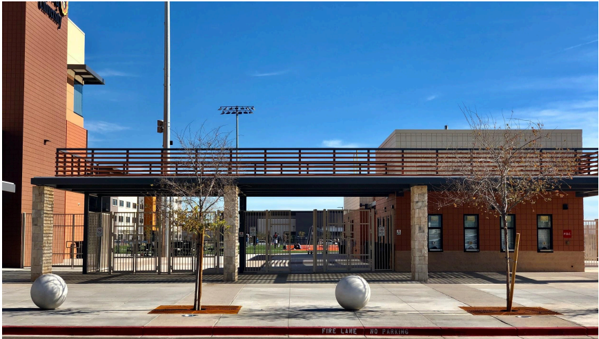
Entry to Spirit Field