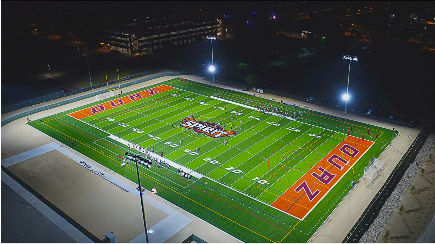
The O'Dell Center