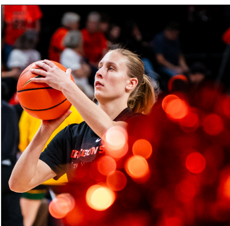
Of Oregon State's six remaining games, three come against teams within a game of them in the WCC.