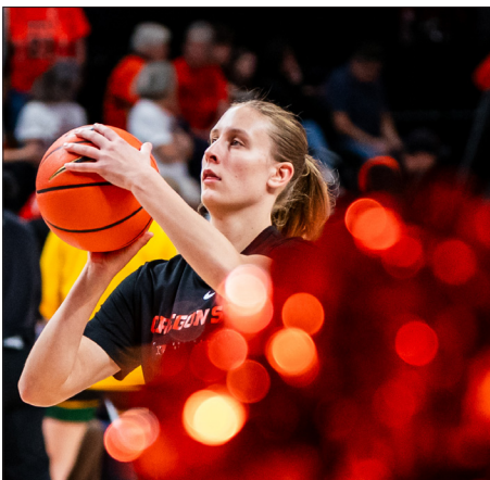
After starting WCC play with 5 of 7 on the road, the Beavers are home for 3 of their last 4 league games

Everyone rebounds at OSU. The Beavers are one of 8 teams in the nation with five players averaging at least 4.7 rebounds per game (Sow, Shuler, Bolden, Villa, William.)