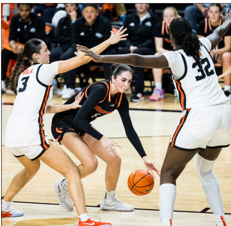
Oregon State allowed a season-low four points in the paint on Saturday against Seattle U