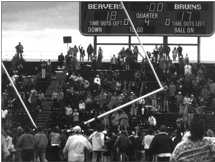
The Beavers defeated UCLA in 1989, 18-17, on national television prompting the fans to tear down the goalposts.