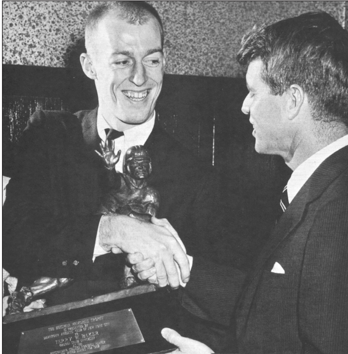
OSU star quarterback Terry Baker earned All-America accolades and the Heisman Trophy following hte 1962 season (shown here while receiving congratulations from Robert Kennedy).