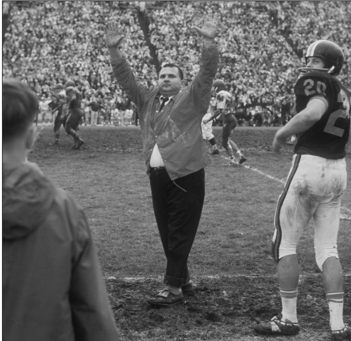
Dee Andros' "Giant Killers" toppled No. 2 Purdue, tied No. 2 UCLA and defeated No. 1 USC all within a month in the 1967 season.