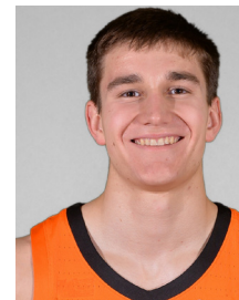
35 WESTON CHURCH