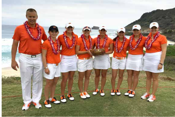
Last March, the Cowgirls won the Dr. Donnis Thompson Invitational in Hawaii for the fourth time, this time by a commanding eight-strokes.