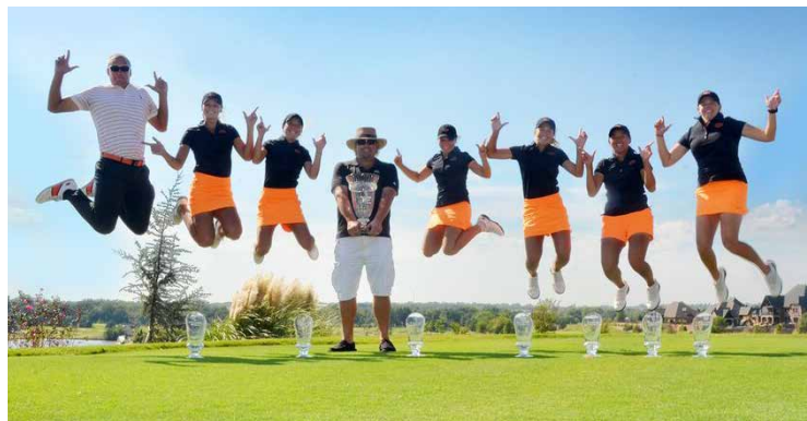
In September, the Cowgirls once again won the Schooner Fall Classic in Norman and were given the trophy by country-music star Toby Keith.