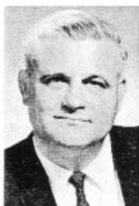
W. W. "Woody" Hayes

W. W. "Woody" Hayes is starting his 21st year as head football coach at The Ohio State University, longer than any other Buckeye football coach.