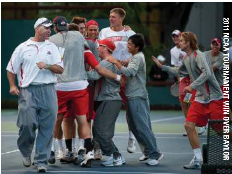
2011 NCAA TOURNAMENT WIN OVER BAYLOR