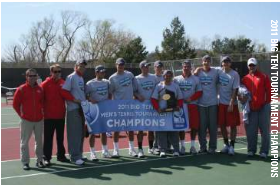
2011 BIG TEN TOURNAMENT CHAMPIONS