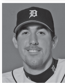
Justin Verlander '04 Pitcher for the Houston Astros