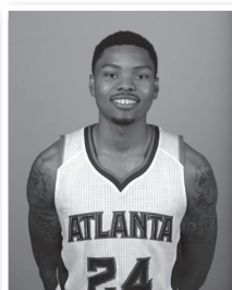
Kent Bazemore '12 Guard for the Portland Trailblazers