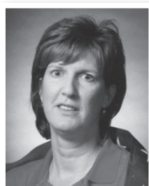
Anne Donovan '83 Basketball Hall of Famer Olympic Gold Medalist