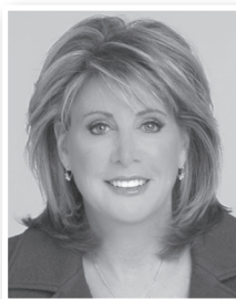
Nancy Lieberman '80 Basketball Hall of Famer