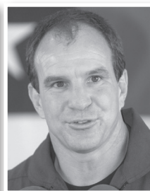
Michael J. Bloomfield '93 NASA Astronaut