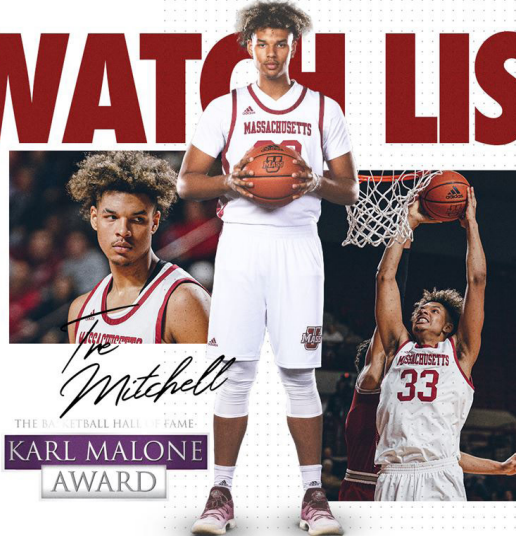
THE BASKETBALL HALL OF FAME KARL MALONE AWARD