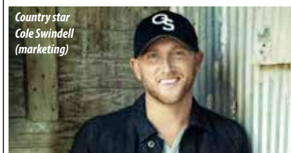
Country star Cole Swindell (marketing)