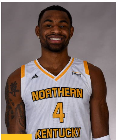
4 6-8 • 225 LBS SENIOR FORWARD PICKERINGTON, OHIO • PICKERINGTON CENTRAL