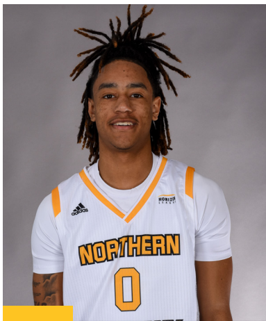
0 6-4 • 175 LBS FRESHMAN GUARD BOWLING GREEN KY. • BOWLING GREEN