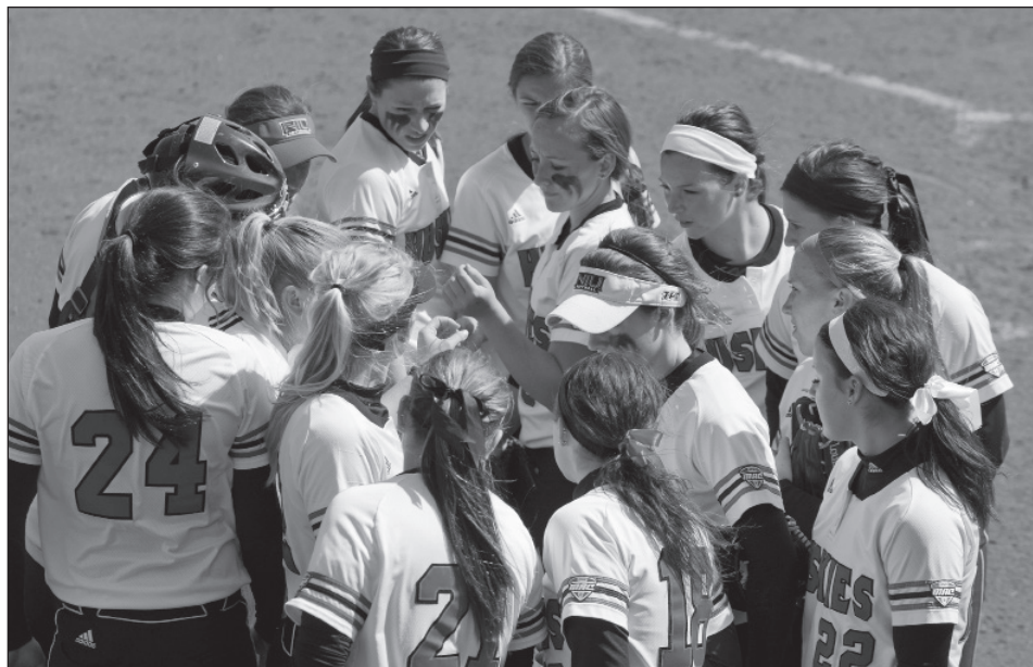
The 2013 Huskies made a run in the 2013 MAC Tournament, advancing to championship Saturday. NIU fell to Central Michigan, 4-2, in 11 innings effectively ending the Huskies' run.