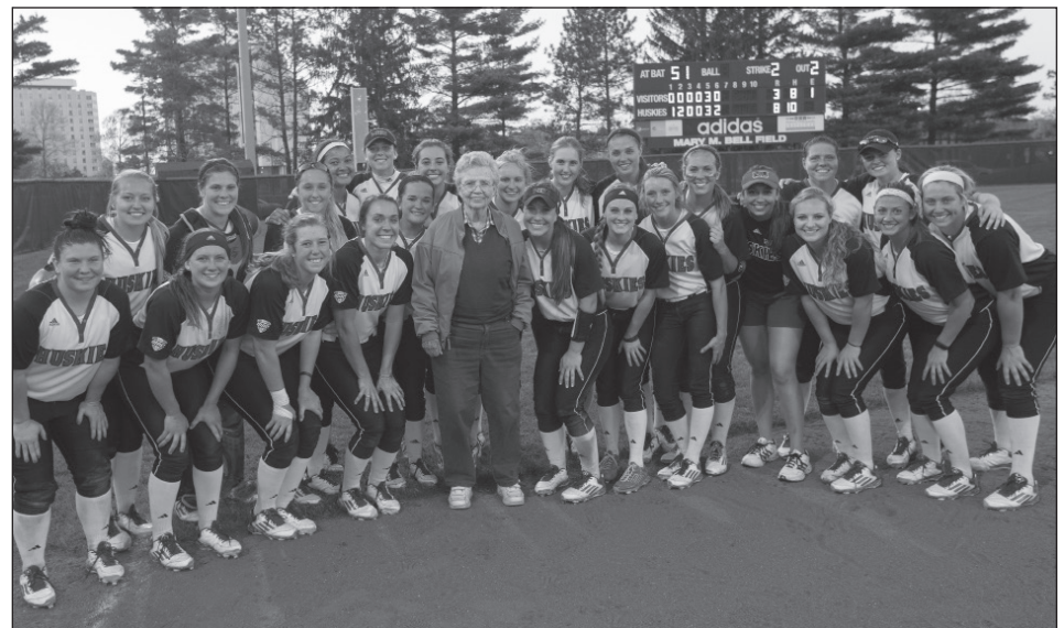
The Huskies clinched the 2016 MAC West Division title after posting an 8-3 victory over Central Michigan in the second game of a doubleheader on May 7.