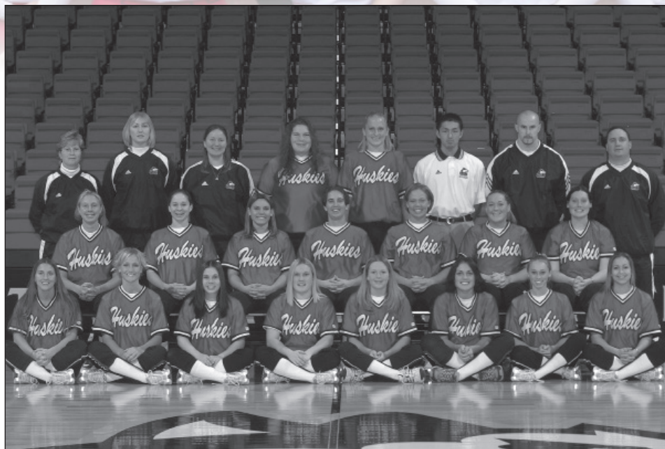
The seniors on the 2003 squad made four straight trips to the MAC Tournament, and capped a run of six straight seasons of advancing to the MAC Tourney.