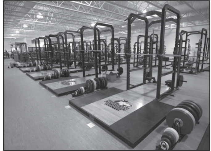
Opened in 2007, the NIU Strength and Conditioning Center allows Huskie student-athletes to train in a state-of-the-art space.